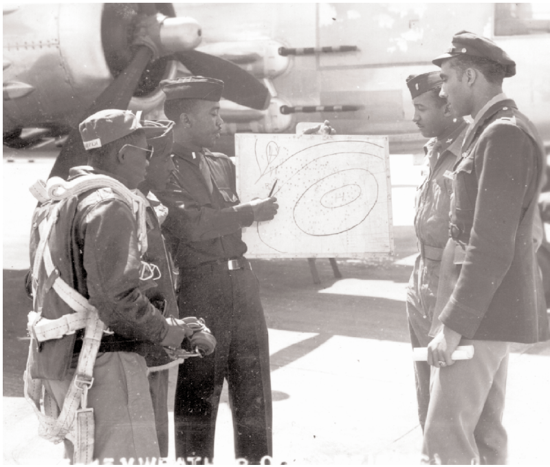
A weather briefing at the 477th Composite Group.

THE POST-WAR AIR WEATHER SERVICE FOR REASONS YET NOT DISCOVERED, STEPPED OUT AHEAD OF THE REST OF THE AIR FORCE AND PRESIDENT HARRY TRUMAN'S EXECUTIVE ORDER 9981